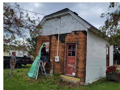
The old Warnke building got a facelift too.