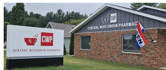
The new Central WI Pharmacy bought & remodeled the old Zuehl's building.